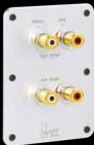
nextgen™ pole terminal WBT-0710 Cu

Because top quality sound is no coincidence, but the result of an accurate planning and work – just as it is the case of our high quality WBT products.