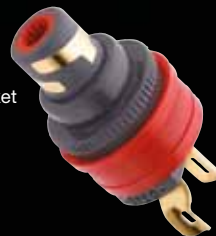
nextgen™ RCA socket WBT-0210 Cu

* Wideband quality: Z = 75 ohm (typ.) up to 1 GHz